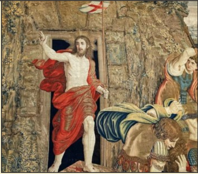
from Raphael's The Resurrection of Christ in the Vatican Museum's Tapestry Gallery

Mass 8:00am, Rosary and Litany of the Blessed Virgin Mary follow