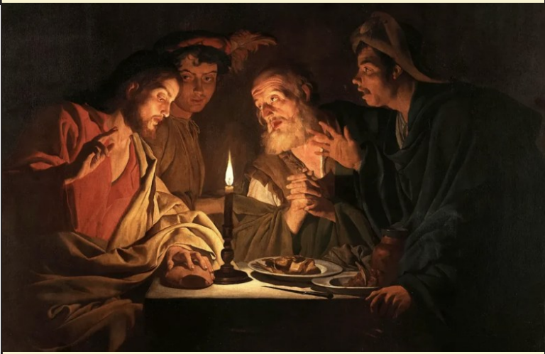
The Supper at Emmaus by Matthias Stom

First Friday of the month: 7:00am and 11:30am Masses followed by the Litany of the Sacred Heart of Jesus 6:30pm Holy Hour of Eucharistic and Vocational Revival First Saturday of the month: Mass 8:00am, Rosary and Litany of the Blessed Virgin Mary follow