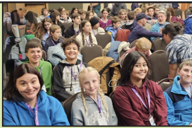
Holy Ghost Middle School Youth at Mountain Madness at YMCA of The Rockies in Estes Park this weekend!!!