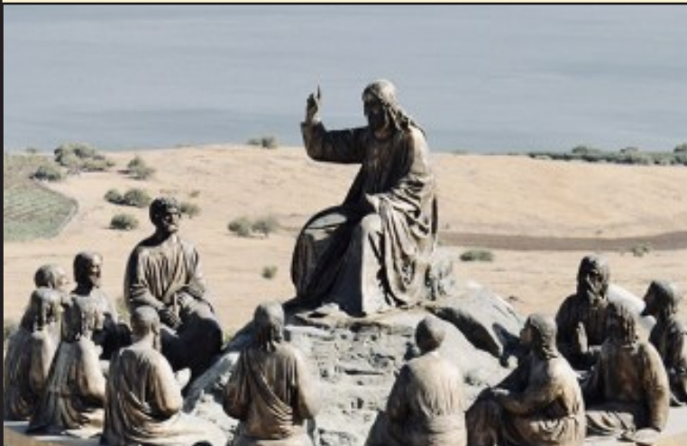
The Beatitudes, Domus Galilee

Mass 8:00am, Rosary and Litany of the Blessed Virgin Mary follow