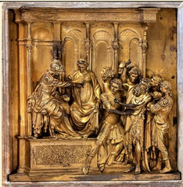
Lorenzo Ghiberti's Arrest of John the Baptist (1417–1427) Gilded bronze relief panel created for the Baptismal Font in the Siena Baptistery, Italy

Archdiocese of Denver: https://archden.org/protection/