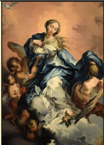
Assumption of the Virgin

Archdiocese of Denver: https://archden.org/protection/