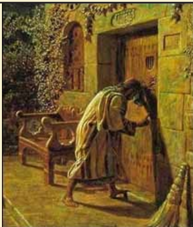
William Holman Hunt's The Importunate Neighbor (1895)

Misa en Español - el 15 de agosto a las 7pm - Solemnidad de la Asunción de María