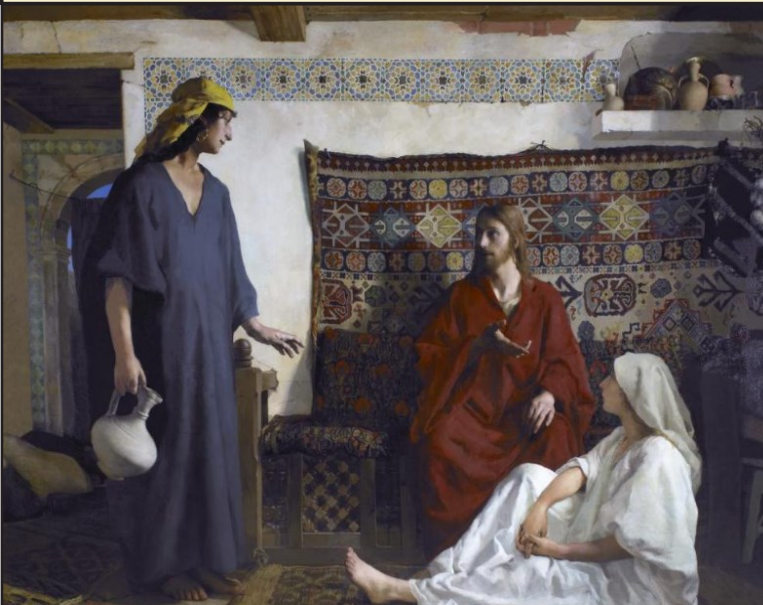
JESUS WITH MARTHA AND MARY

Mass 8:00am, Rosary and Litany of the Blessed Virgin Mary follow.