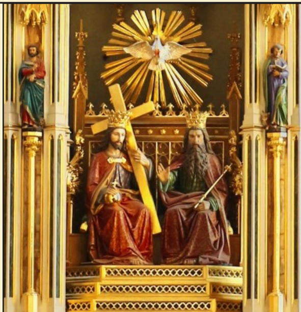
From the altarpiece of the Basilica of the Holy Trinity in Krakow, Poland