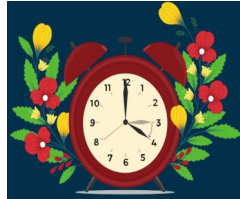
Set your clocks one hour ahead before going to bed on Saturday, March 8