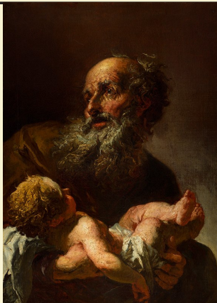
Simeon with the Infant Jesus - Peter Brandl

Rosary and Litany of the Blessed Virgin Mary at 8:30am