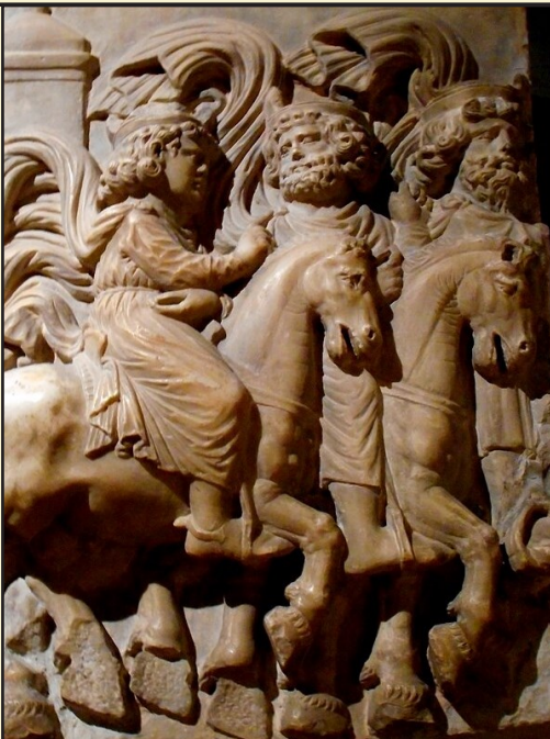
"Epiphany" sculpture by a follower of Nicola Pisano