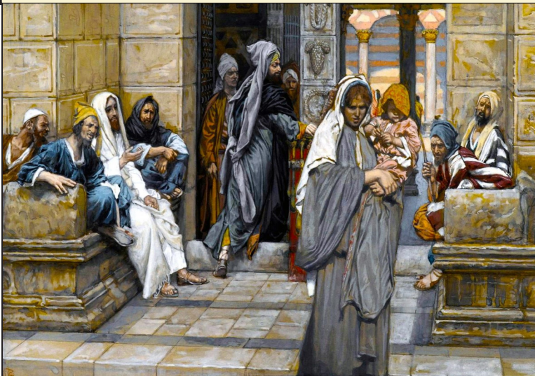
The Widow's Mite by James Tissot

Rosary and Litany of the Blessed Virgin Mary at 8:30am